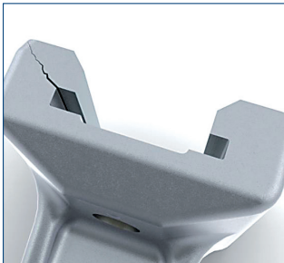
Eliminate costly casting failure

A robust, lightweight Blowhead assembly manufactured from high quality aluminium billet for strength and accuracy. It is equipped with a steel Quick Change adaptor to provide secure clamping and eliminate problematic casting failure.