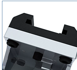
Steel QC adaptor